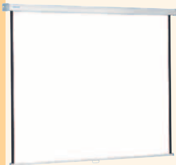
▲ Projection screen with spring mechanism (max. 200 cm wide).

Easy mounting on wall, ceiling and/or in cover via integrated hanging.