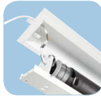
In the case mounting possibility