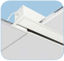
Perfect integration into the ceiling