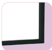
Black matte aluminium frame