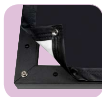
Projection surface attaches with snaps