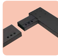
Black frame optional