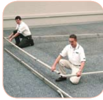
Simple, quick set up and portability