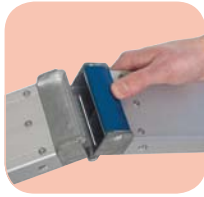
Snap Latch hinge design