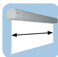
Available in widths from 5 to 7 metres