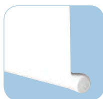
Round slat bar