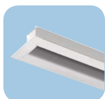
Ceiling Mounting Kit accessory