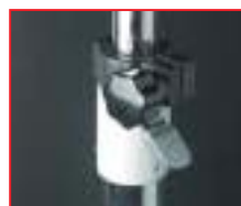
Lock knob with fixing button and unlock lever