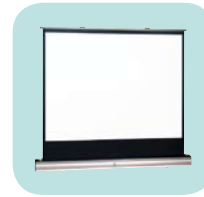
50" table model