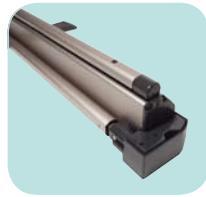
Arm is protected during transport