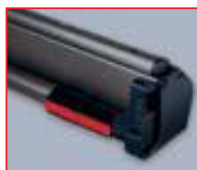
Retracted screen with fixed tripod tube