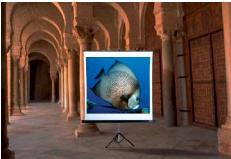
Tripod projection screens Alpha - Technical data (all dimensions in cm)