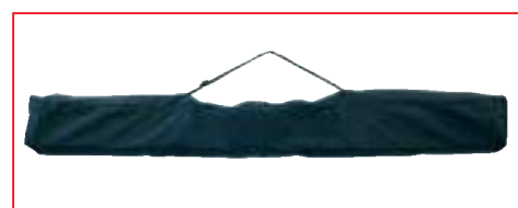
Carrying bag for Tripod screens