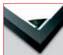
Stable corner elements