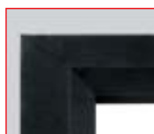
High-quality black frame