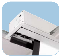
Electrically operated closure panel