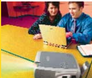
Collaborate with ease.