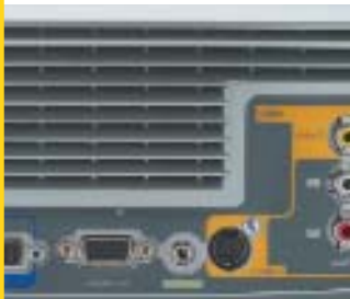
Colour-coded connections let you be on in seconds.