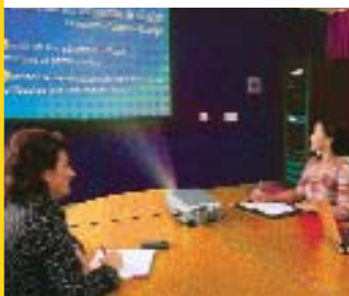
Exercise your option for wireless freedom.