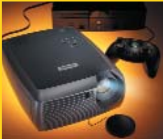
Business brilliance. Entertainment excitement.