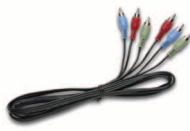
HDTV component cable (RGB) L1634A

Always have a back-up lamp module for your presentations.