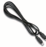
6-foot S-video cable L1635A

Lightweight and easy to carry with a built-in handle, this mobile screen sets up easily anywhere you need it.