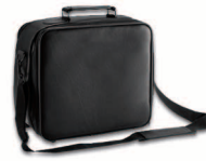
Carrying case L1629A

Easily connect to a wide range of video equipment, from a VCR to a camcorder.