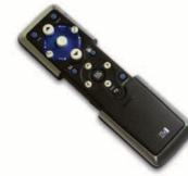
Premium wireless remote control with USB L1631A

The lightweight and sturdy design allows you to take it wherever you need to present.