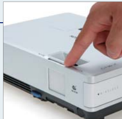
Close slide. A/V mute.

You can quickly stop and resume projection easily by opening and closing the A/V mute slide. It will automatically change to the low fan noise mode when the slide is closed. This function enables you to give more effective presentations by allowing you to halt projection and draw the audience's attention elsewhere to show other materials during your presentation.