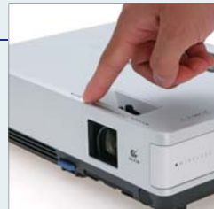
Open slide. Resume presentation.