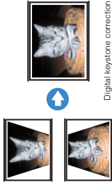
Digital keystone correction

Digital Keystone correction (vertical): Image skewing resulting from a screen that is out of vertical alignment with the projector (keystoning) can be corrected digitally.