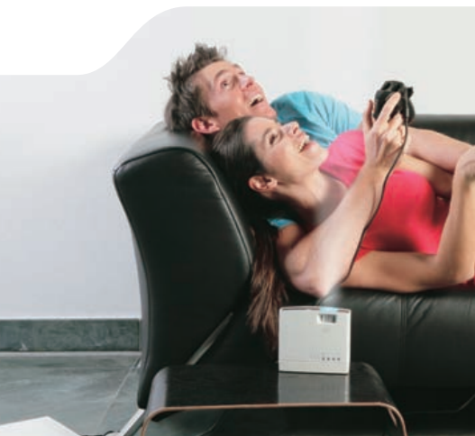
Projection to the ceiling, ...

Make presentations on the go, wherever you are, at the drop of a hat! That's no problem with Toshiba's new LED, the ff1. Toshiba's latest innovation in projection technology - it is so small, versatile and light-weight that you will never want to part with it!