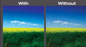
Image and color enhancement technologies