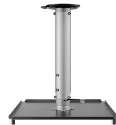
Ceiling Mount: 5J.JCY10.001