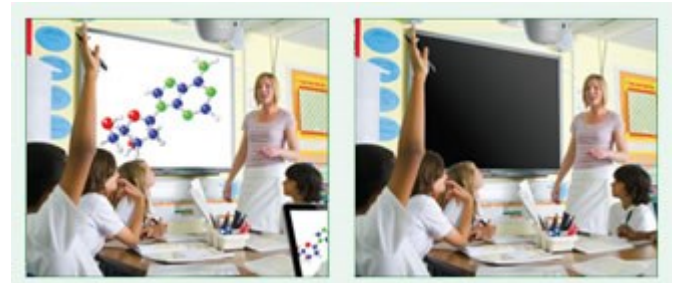
Eco AV mute off 100% power consumption

Stay in control of your presentation with Eco AV mute. Direct your audience's attention away from the screen by blanking the image when no longer needed. This also reduces the power consumption by up to 70%, further prolonging the life of your lamp.