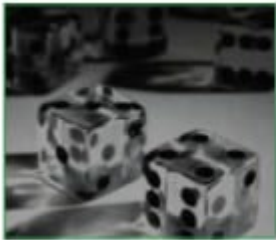
2000:1 Contrast Ratio

Add more depth to your image with a high contrast projector; with brighter whites and ultra-rich blacks, images come alive and text appears crisp and clear - ideal for business and education applications.