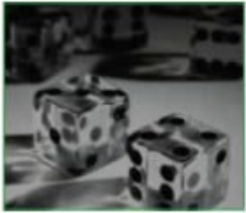
2000:1 Contrast Ratio

Add more depth to your image with a high contrast projector; with brighter whites and ultra-rich blacks, images come alive and text appears crisp and clear - ideal for business and education applications.