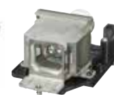
LMP-E212 Projector Lamp (for replacement)