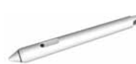
IFU-PN200M Master Interactive Pen Device IFU-PN200S Sub Interactive Pen Device (For VPL-SW526C only)