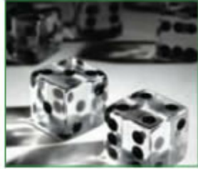
13,000:1 Contrast Ratio