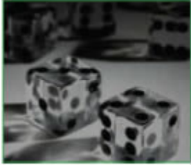
2000:1 Contrast Ratio

Bright 2800 ANSI Lumens, Perfect for projecting in lights on environments. And with DarkChip3™ technology from Texas Instruments combined with Eco+ technology produces a stunning 15,000:1 contrast ratio for pin sharp graphics and crystal clear text. Crisper whites, ultra-rich blacks make images come alive and text easier to read - ideal for business and education presentations.