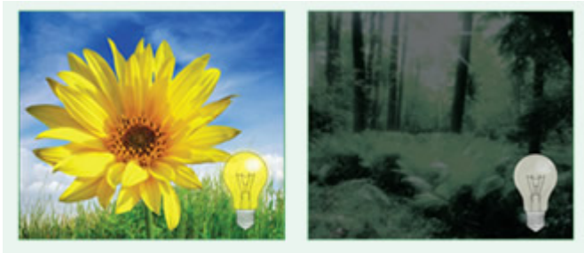
Bright scene ~ 100% power consumption

Dynamically adjusts the brightness and power consumption