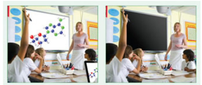
Eco AV mute off 100% power consumption

Stay in control of your presentation with the Eco AV mute feature. Direct your audience's attention away from the screen by blanking the image when no longer needed. This also instantly reduces the power consumption to 30%, further prolonging the life of your lamp.