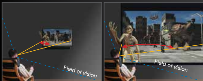
50" 3D Television

It is a widely accepted fact that the bigger the image, the greater the 3D effect - for the best results it is essential to fill your field of vision, without having to be too close to the screen. Even a huge 50" TV can only create a window on the 3D world, whereas the immersion & excitement created by a massive 150" projection screen makes you feel like you are part of the action!