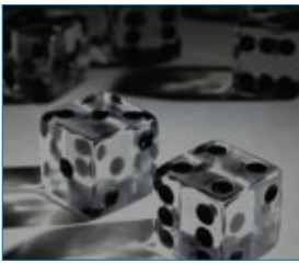
2000:1 Contrast Ratio

Bright 3000 ANSI Lumens, Perfect for projecting in lights on environments. And with DarkChip3™ technology from Texas Instruments combined with Eco+ technology produces a stunning 13,000:1 contrast ratio for pin sharp graphics and crystal clear text. Crisper whites, ultra-rich blacks make images come alive and text easier to read - ideal for business and education presentations.