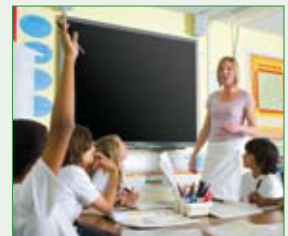
Eco AV mute on 30% Power consumption