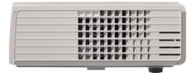
Right Side Profile