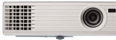
Front 3/4 View