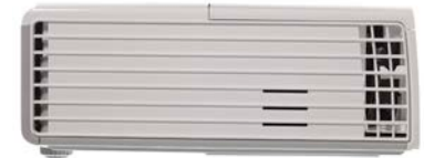
Left Side Profile