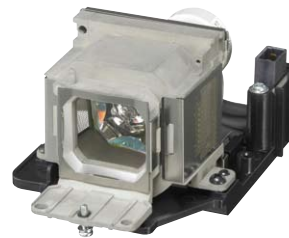
LMP-E212 Projector Lamp (for replacement)