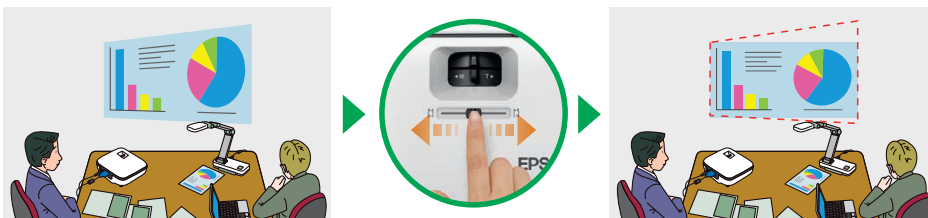
Horizontal Keystone Correction Adjuster: This intuitive new slider lets you adjust images to the correct shape when the projector is at an angle to the screen

Eliminate the need for photocopies: share 3D objects using the ELPDC06 visualiser