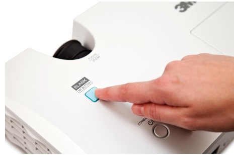
With 'My Button' the presenter can instantly blank the screen

Adjustable height extension 78-6969-9698-8