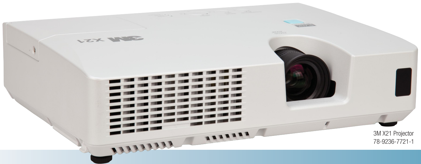
3M X21 Projector 78-9236-7721-1

In the classroom the X21 model offers White, Green and Blackboard modes. With built-in image templates the user can also project useful guides onto the screen for assisting annotation. Other cost-saving features that make the X21 not only the ideal education projector but also a highly efficient business tool include Hybrid filters for 5,000 hour maintenance intervals; less than 1 watt stand-by power consumption; and 'Auto-eco' Mode for cost efficiency management.