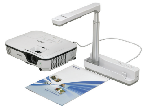
Share 3D objects using the ELPDC06 USB visualiser