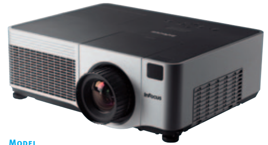
MODEL IN5110 WUXGA (1920 x 1200) 4200 lumens