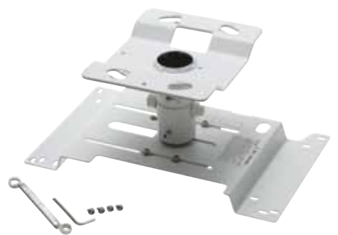
Tailor-made ceiling mount for easy installation and security