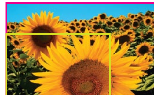
WXGA 1,280 x 800 PIXELS

With WXGA (1280 x 800) and WUXGA (1920 x 1200) native resolutions, the IN5500 series offers substantially wider space to display high resolution images for the next generation of operating systems and full high definition 1080p video.