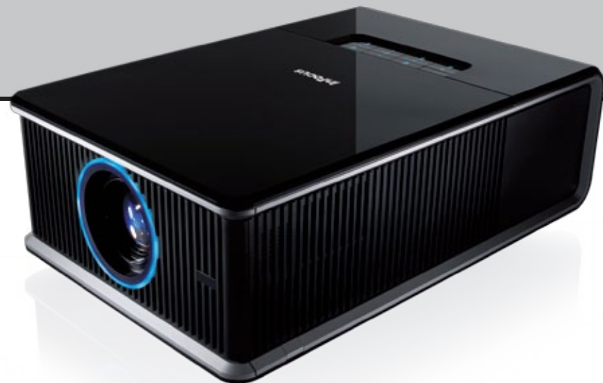
Optional Skin Glass Black

Offering best-in-class performance and a wealth of features, the IN5500 series projectors use DLP® DarkChip™ technology and InFocus award-winning BrilliantColor™ implementation, and offer up to WUXGA (1920 x 1200) resolution. These projectors are ideal for demanding professional applications requiring flexible lens options. With rich connectivity and embedded networking, the IN5500 series also features a filter-free design for fail-safe 24/7 operation. Customizable skins and an integrated cable management give the IN5500 series a sleek, elegant profile to complement any venue. And with a high brightness of up to 7000 lumens, any audience will sit up and take notice.