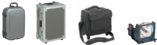
VT60ROLLER VT60ATAPRO TRAVELPRO200 LAMP