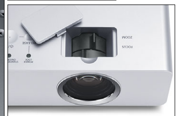
A zoom/focus ring cover and a lens cover