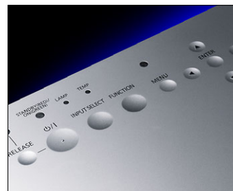
Touch-sensor controls on the top