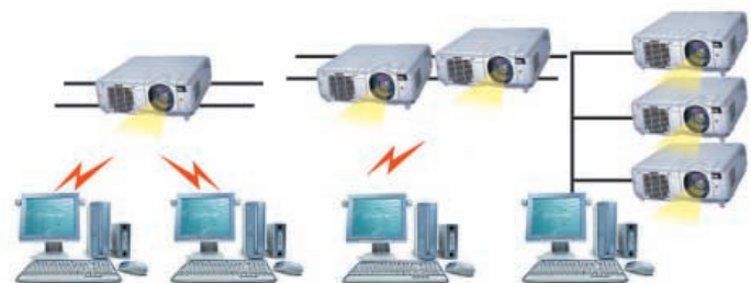
Wireless picture projection from several PCs to a single projector.

An innovative microprocessor makes the Auto 3D Reform™ functionality possible. It ensures the projectors' ability to make automatic horizontal, vertical and diagonal Keystone Corrections. At the same time, the Geometric Correction functionality enables projection on curved or uneven surfaces, e.g. on columns, pillars or in corners. This function requires an NEC GT remote control.