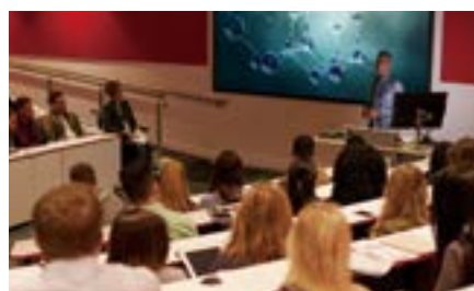
For academic use